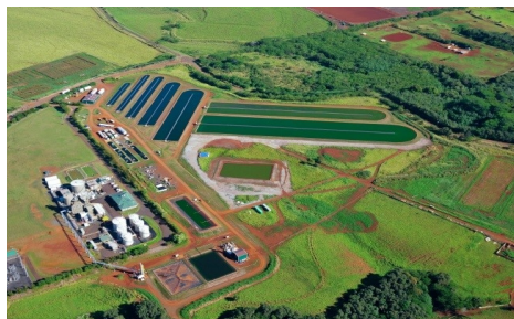
(Global Algae Innovations Kaua`i Farm)

their company is quite obviously stated in the name, and they hope to innovate ways to reduce the cost of farming algae, especially for use in biofuels. Algae based biofuels are currently too expensive to compete with other biofuels, but Global Algae Innovations hopes to bring the cost of algae biofuel down to 2 dollars per gallon. Algae biofuels are better than traditional biofuels, because algae: (1) grows much faster than other terrestrial crops currently used to produce biofuels, (2) uses far less water than traditional crops, and (3) can be farmed on land where other things will not grow. Also, production of algae biofuel produces a protein rich byproduct, which could be critical to quenching the growing demand for farmland used to produce protein rich animal feed. Algae may literally be a green solution.