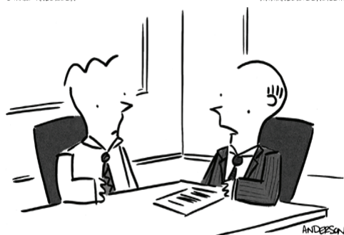
"First, we deny any wrongdoing. Then we'll want to play up any wrongdoing."