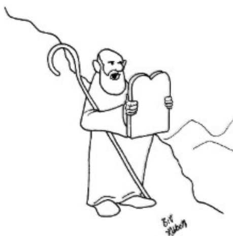
"Hold up - I have to read the legal disclaimer."